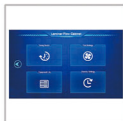
LCD Display Digital LCD display: airflow level