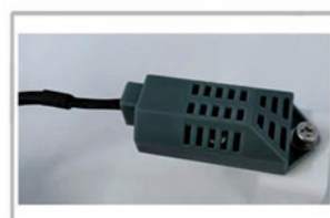
Temperature and Humidity Sensor