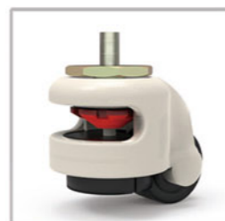
Footmaster Caster Universal caster with brake and leveling feet